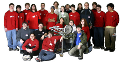
Camp Counselors High school students from Dane County's award winning BadgerBOTS robotics team. Four counselors every day!

Additional copies of this flyer are available online at http://www.badgerbots.org